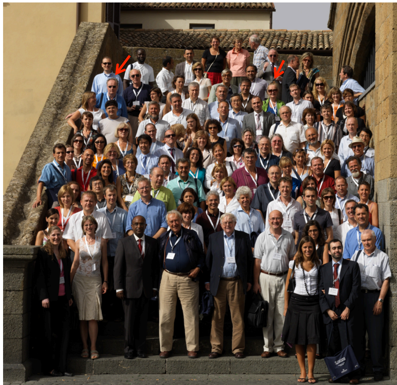
Participants to Neurodiab Orvieto 2008